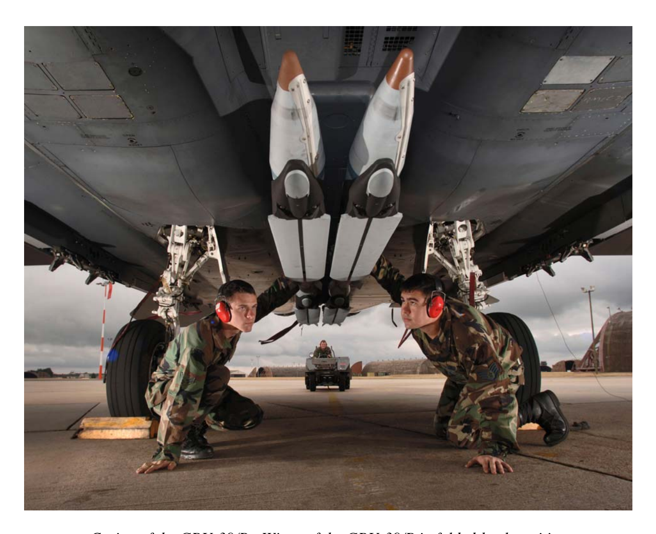
Casing of the GBU-39/B - Wings of the GBU-39/B in folded-back position

The GBU-39 is also designated as SDB1, and is the first of the Small Diameter Bombs: it is conceived as a cheap bomb which gives reduced collateral damage but is excellent at penetrating steel and reinforced concrete. Despite its small size, it is a "bunker-buster" bomb and it was sold to Israel as such.